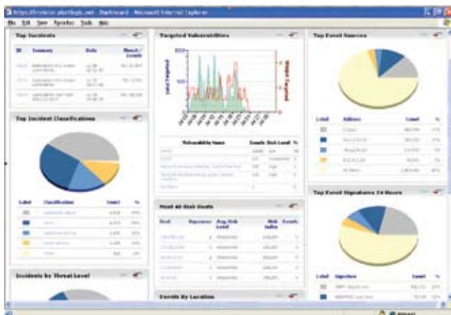
Alert Logic Threat Manager delivers a critical layer of internal network protection, preventing worms, botnets, Trojans, and other malicious intruders from propagating throughout your network.

Threat Manager combines intrusion protection and vulnerability management technology into a single integrated solution that offers both proactive and reactive protection from the latest threats. Threat Manager's unique on-demand architecture eliminates the false alarms typically associated with intrusion detection technology. All of the alerts from our network appliance are fed directly into a centralized expert system hosted in our datacenter. The expert system correlates the IDS alert data with vulnerability data and real-time threat trend information from all Alert Logic customers worldwide, and identifies only valid security incidents that threaten your network – something a traditional standalone appliance simply cannot accomplish.