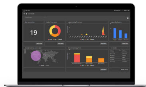
Alert Logic Console Dashboard

Our platform delivers real-time reporting, giving you access to information on risk, vulnerabilities, remediation activities, configuration exposures, and compliance status. With this intelligence, you can focus on a prioritized order of threats that need further triage, drill down into threats to act on or mitigate exposure, and provide intuitive risk visualization.